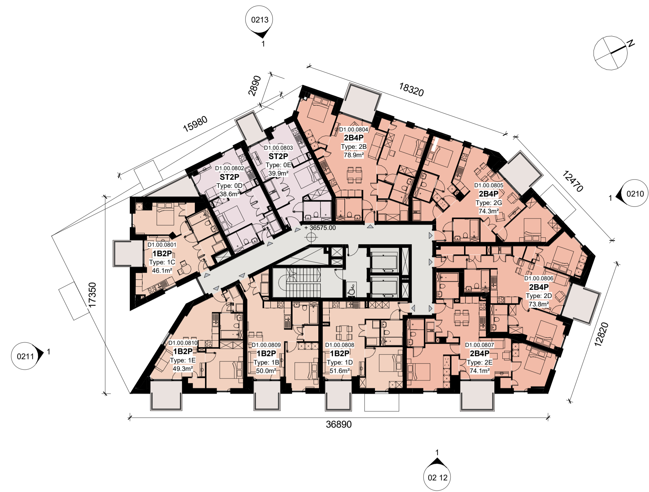
2 Proposed FFL - 08 1 : 200