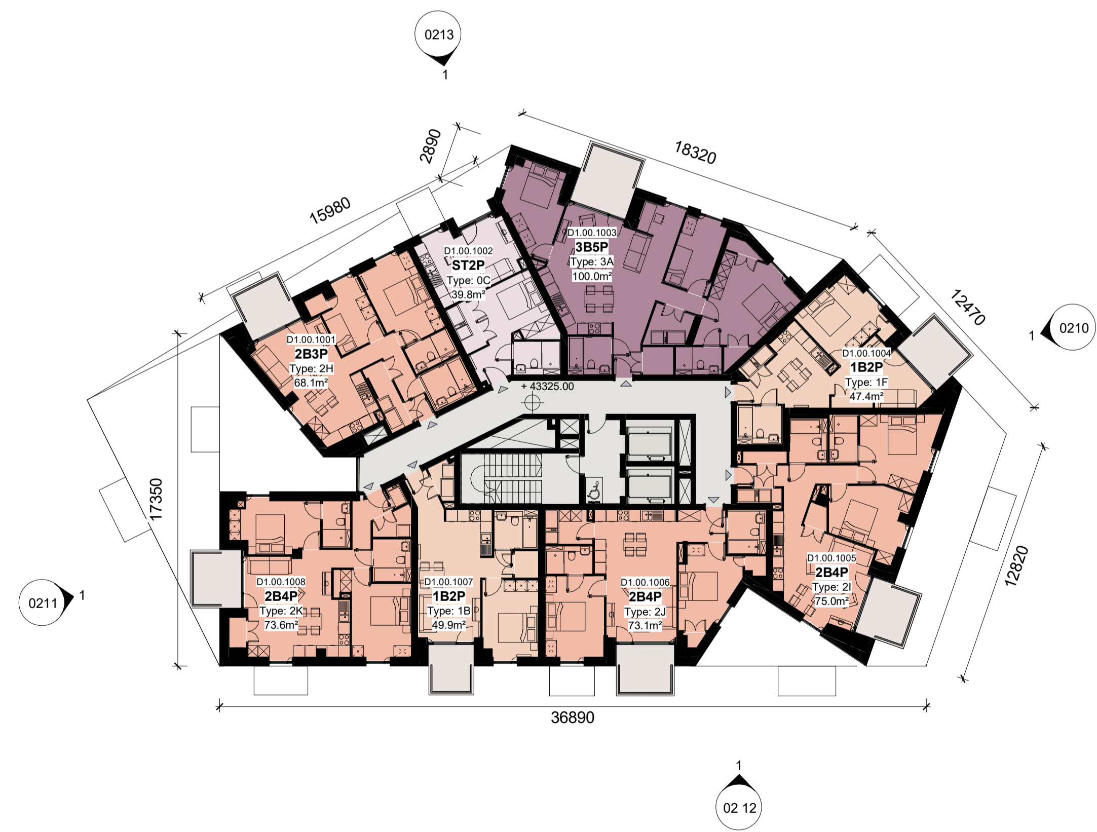
4 Proposed Typical Plan - FFL - 10 / 11 / 12 1 : 200